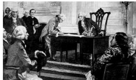
Signing of the Constitution