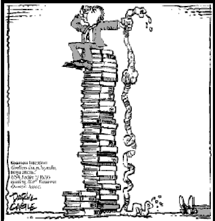
If you gut a small businessman, his intestines will stretch to about the length of the 202 volume Code of Federal Regulations governing small business.