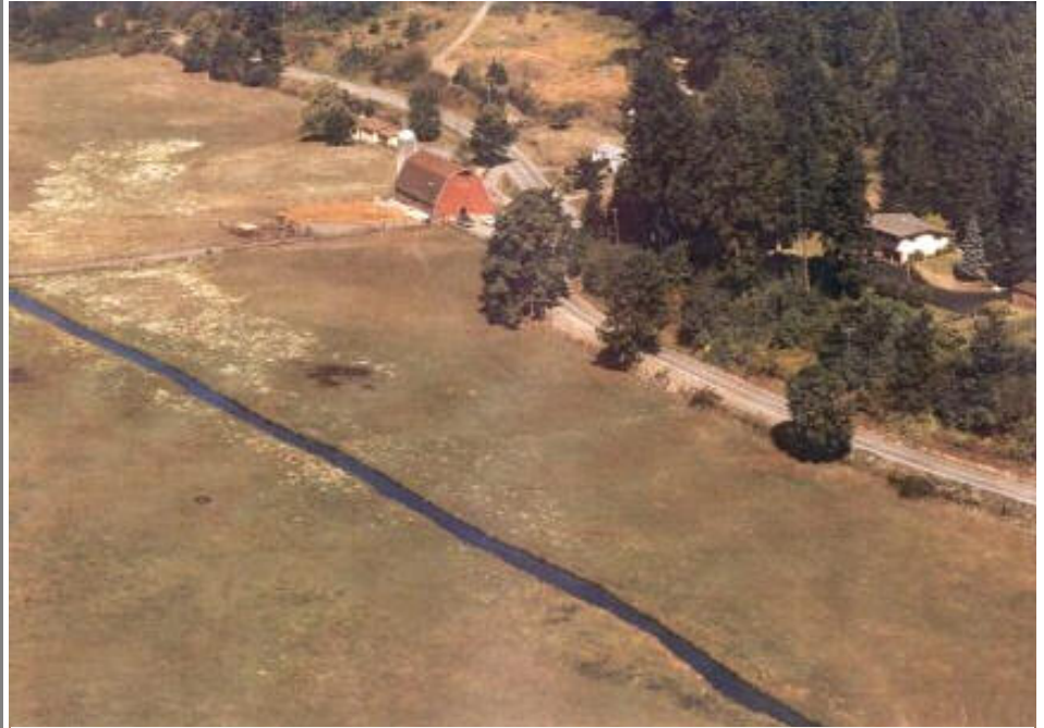
COLASURDO FARM—SPRING 1986

Subscriptions are $20 per year. MVEC membership is $40 per year. Donations are gladly accepted.