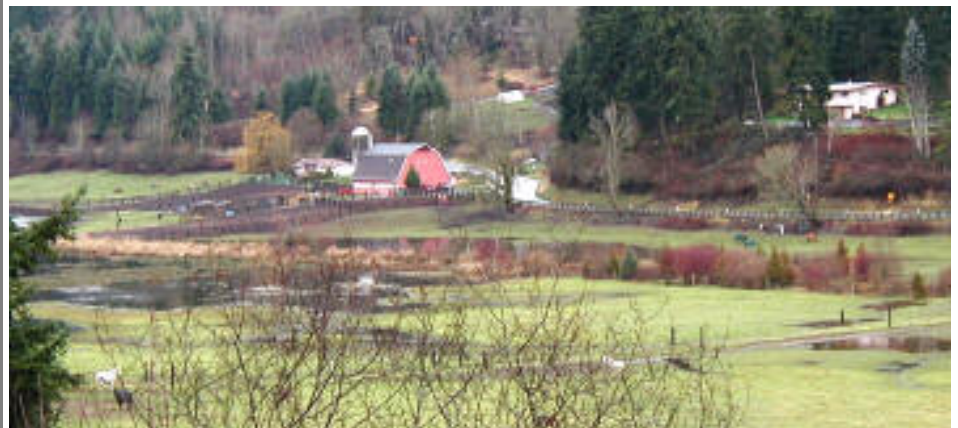
COLASURDO FARM-SPRING 2003

The Sensitive Areas Ordinance passed in 1990 has destroyed May Valley but it has taken 10 years—so a new Critical Areas Ordinance has been proposed by DDES to speed up the process!