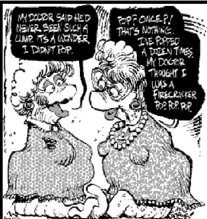
The government funded a University of Washington study investigating constipation among worms.